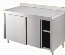
Cabinet with 2 sliding door and shelf