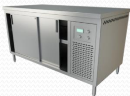
Plate drying cabinet