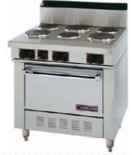
Open burner (2- 4- 6 induction burners)