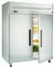
Upright freezer (2-4 doors)