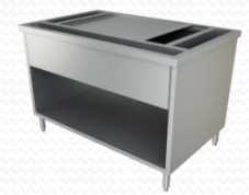
Cabinet wine Bin, Bottle tray