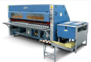
Flatwork Ironer & Folder