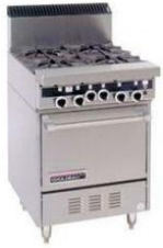
4 - open burner with oven