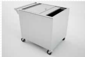
Mobile flour bin