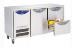
Counter freezer with drawer