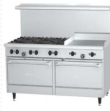
Griddle (smooth/ ribbed)