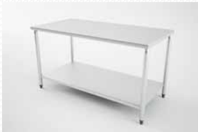
Table with plain shelf at bottom