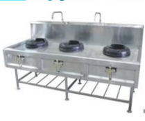
Asian kitchen 3 drawers