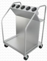
Tray & cutlery trolley