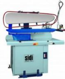
Collar & cuff press