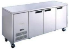
Counter chiller (2-3-4 doors)