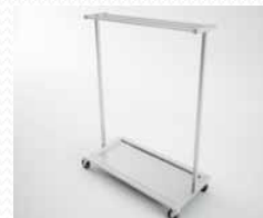
Duck hanging trolley