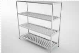
4 - tier slatted shelf