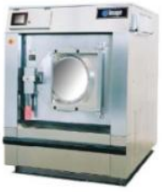
Washer extractor low speed