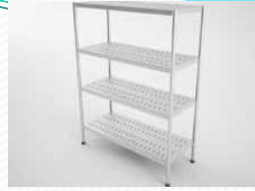
4 - tier perforated shelf