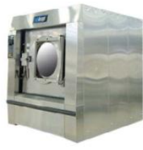
Washer extractor high speed