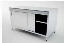
Cabinet with sliding door