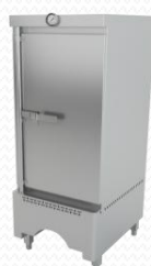
Rice cooker, 50 kg