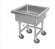
Mobile soak sink