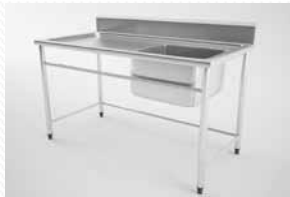
Single sink table