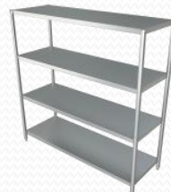
4 tier flat shelf