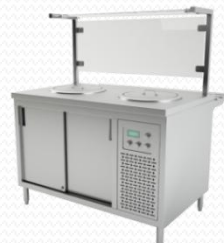
Electric noodle range & electric rice warmer