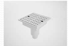
Floor gully with grating