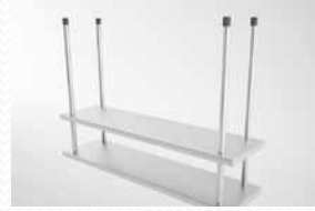
2 - tier hanging open shelf