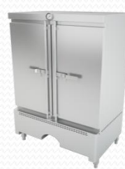
Rice cooker, 100 kg