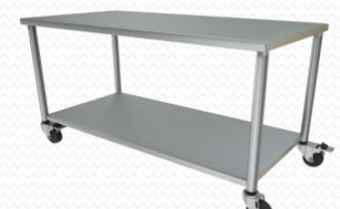
Mobile work table