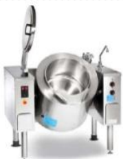
Bone stew pot