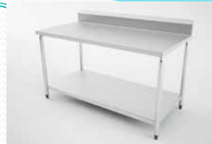
Table with plain shelf at bottom