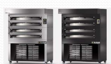
Deck bakery oven