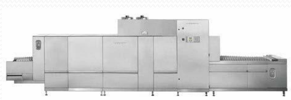
Fly - type dish washer