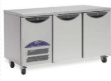
Counter freezer (2-3-4 doors)