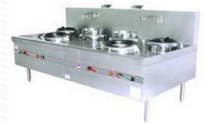
Kwai wok range with blower ( 2 burners )