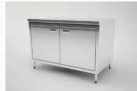
Cabinet with hinge door