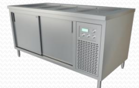
Bain marie with cabinet 5 tray