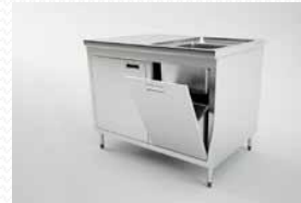
Cabinet with built-in sink & trash drawer