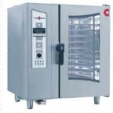
Combine steamer (6 trays, 10 trays, 12 trays)