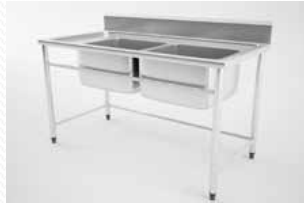
Double sink table