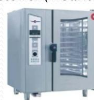
Combine steamer (6 trays, 10 trays, 12 trays)