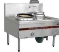
Kwai wok range with blower ( 1 burner )