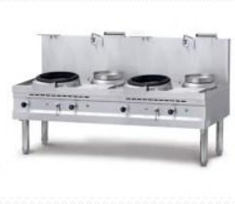
Kwai wok range with blower (2 burners)