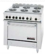
Open burner (2 - 4 - 6 electric burners)