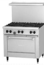
Open burner (2- 4- 6 gas burners)