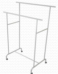
Mobile garment rail