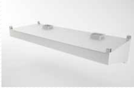
Exhaust hood with fresh air return