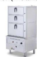
3 - Deck steamer