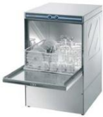
Glass washer hose reel