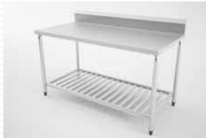
Table with slatted shelf at bottom