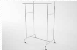
Mobile garment rail