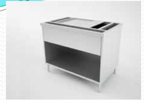
Cabinet with ice bin, Bottle tray