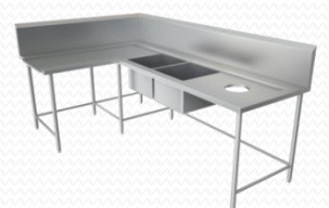
Soiled dish table, single sink with hole for garbage