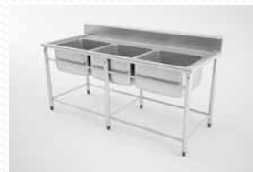
Sink Table, 3 Bowls