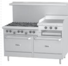
6 - open burner with oven