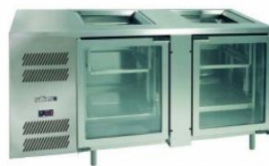
Counter chiller (2-3-4 doors)