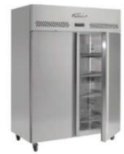
Upright chiller (2-4 doors)