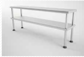
2 - tier overhead shelf