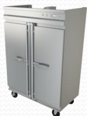
Food warmer cabinet