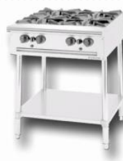
Deluxe range without oven