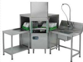
Conveyor dish washer