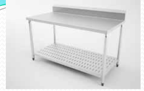
Table with punching shelf at bottom