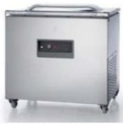
Vacuum packing machine