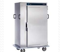
Heated banquet cart