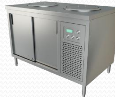
Electric noodle range & electric rice warmer