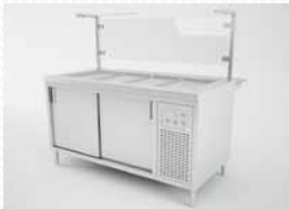
Bain marie with cabinet 5 tray