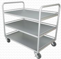
3 - tier service trolley