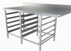
Clean dish table with rack slide