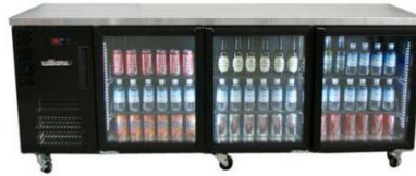
Glass door counter chiller