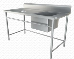
Soiled dish table, single sink with hole for garbage