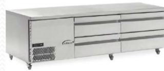
Counter chiller with drawer