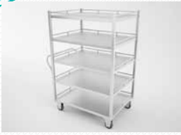
5 - tier trolley