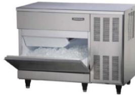
Cube ice machine