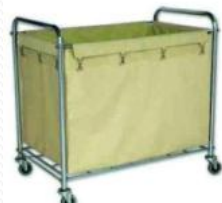
Dirty laundry trolley