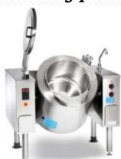
Stock Pot Stove