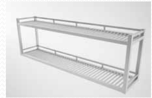
2 - tier hanging wall shelf