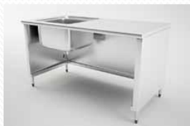
Sink cabinet, 1 bowl with hinge and trash drawer