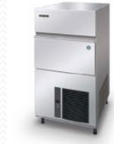
Flake ice machine